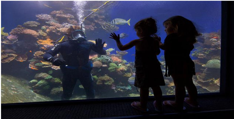
Underwater observatory

2.5 hour Jeep tour – (8 persons per Jeep)$ 310 per jeep